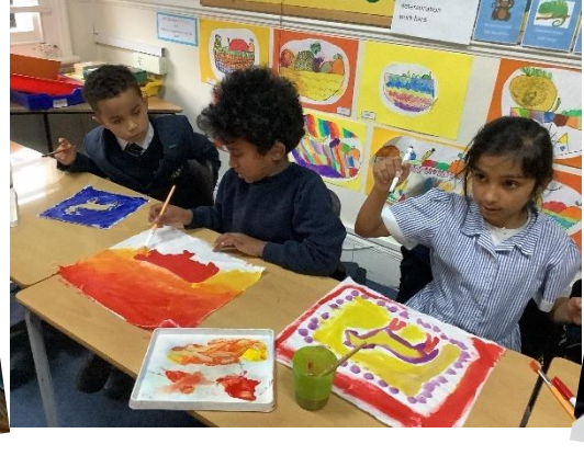
Art club creativity