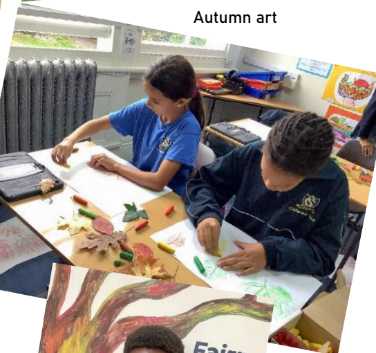
A leaf on our tree