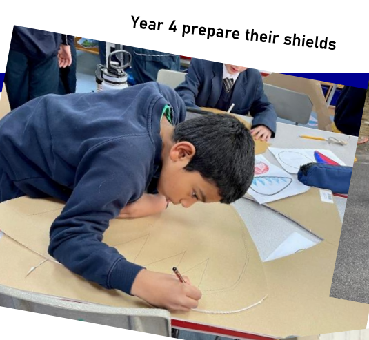
Year 4 prepare their shields