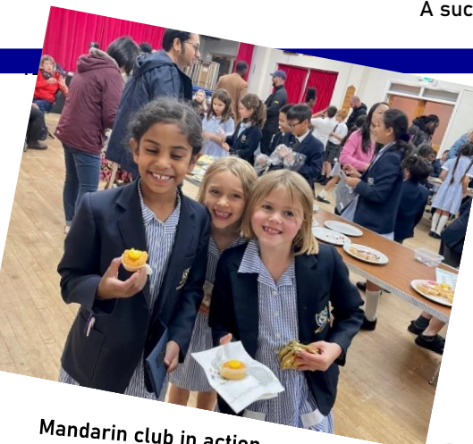
Mandarin club in action