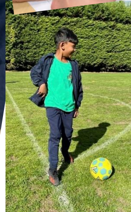
Football skills at Walcountians