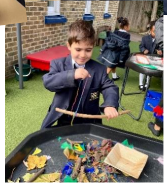
Kandinsky art in Year 1