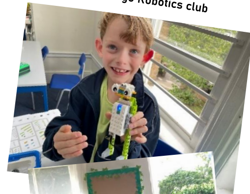
Lego Robotics club