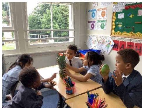
Fruit art in Year 2