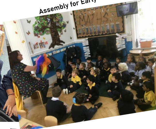
Assembly for Early Years