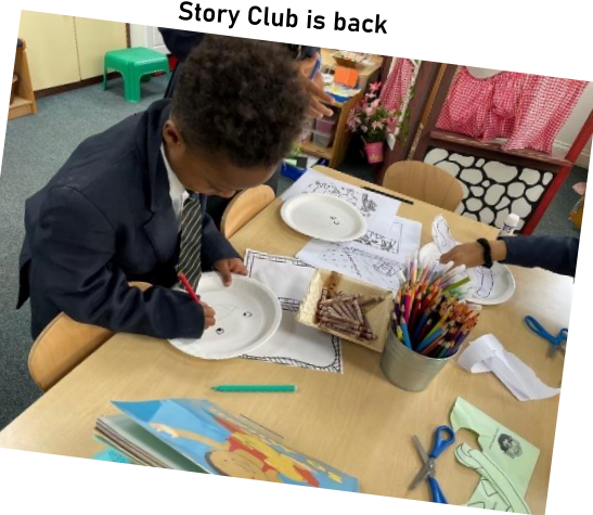
Story Club is back