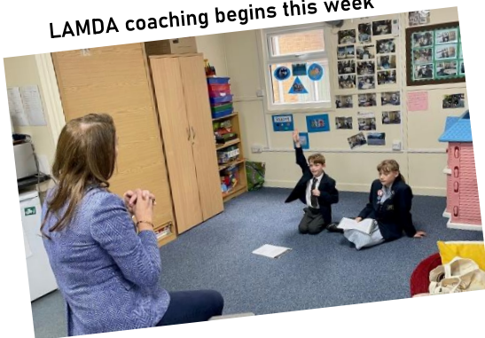
LAMDA coaching begins this week