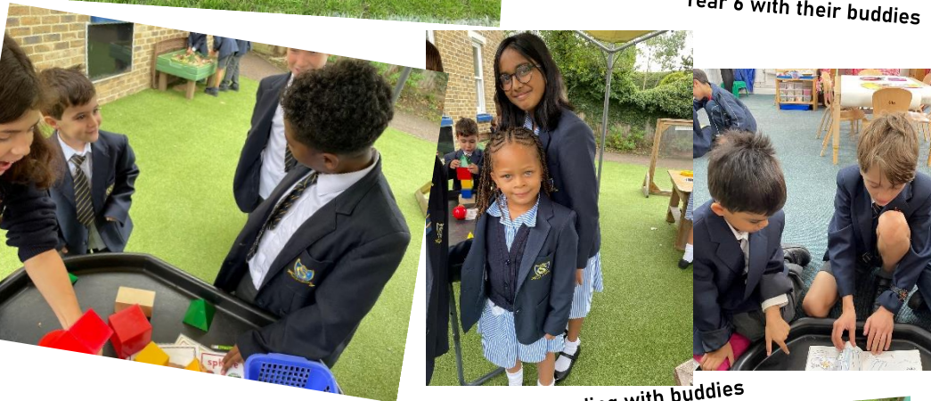
Year 6 with their buddies