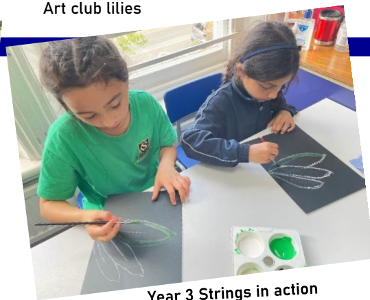
Art club lilies