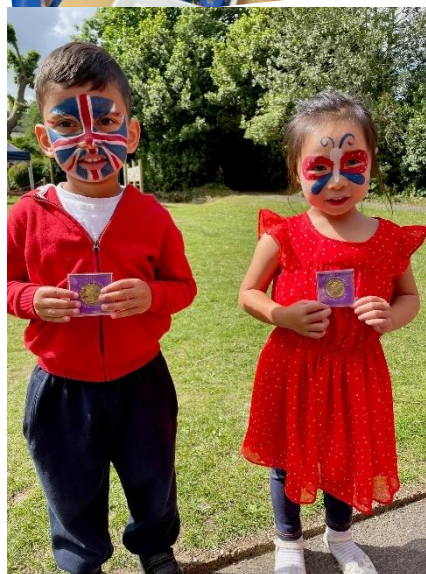
Jubilee medals for all!