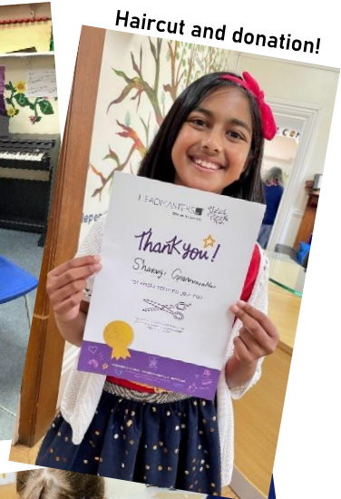
Haircut and donation!