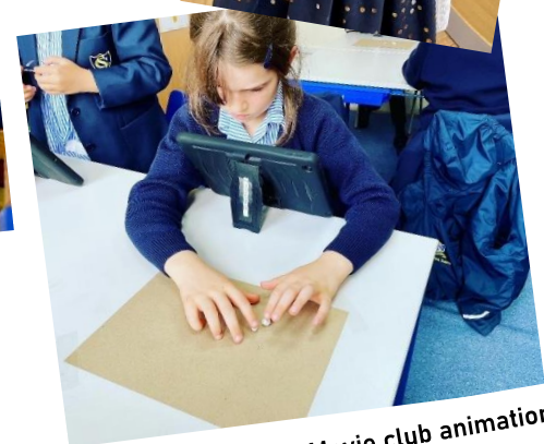
Movie club animations