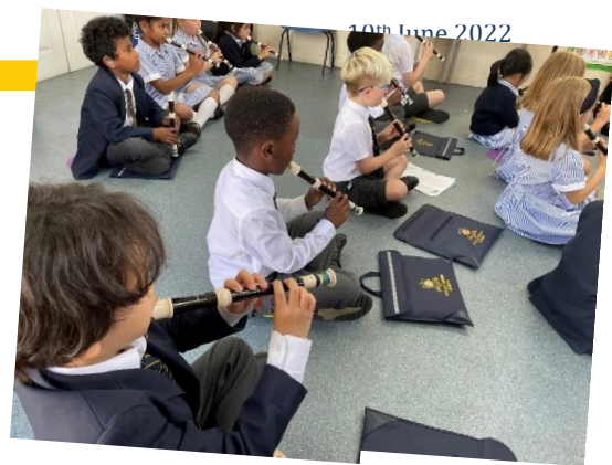
Year 2 recorders