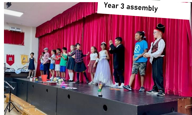
Year 3 assembly