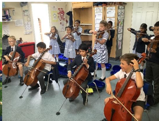
Year 3 Strings in action