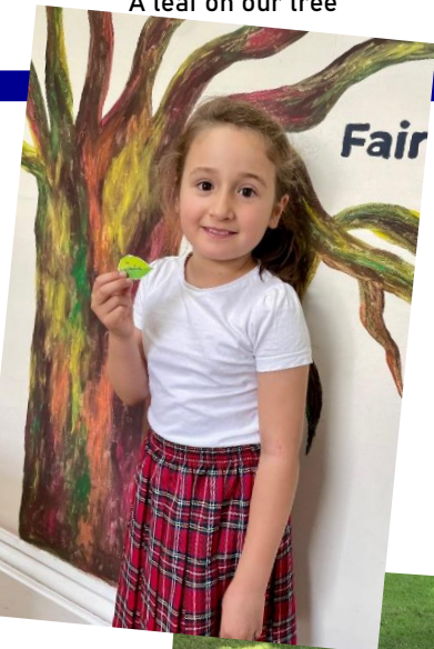
A leaf on our tree