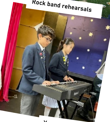
Rock band rehearsals