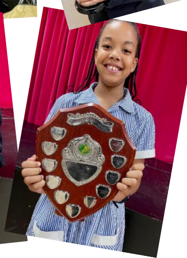
Sports Awards 2022