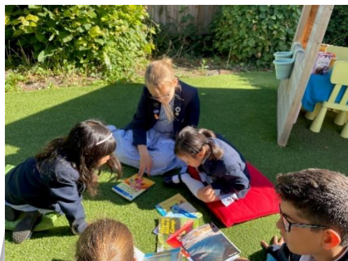
Year 6 read outside with buddies