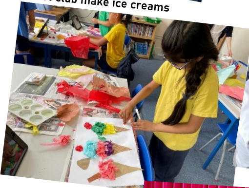
Art club make ice creams