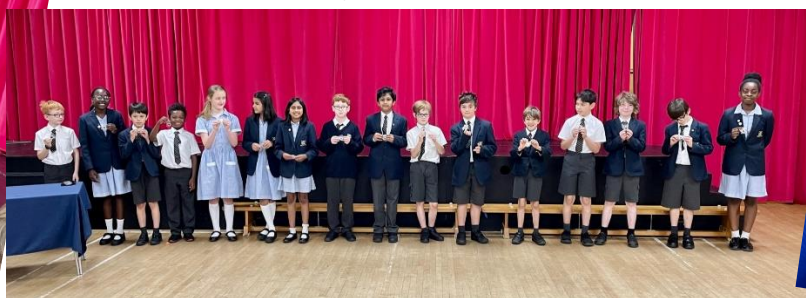
Year 5 Collingwood Way Silver awards