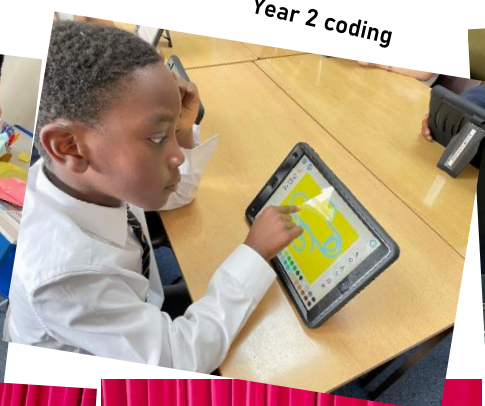
Year 2 coding