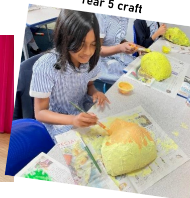
Year 5 craft