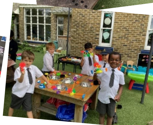
Year 5 craft