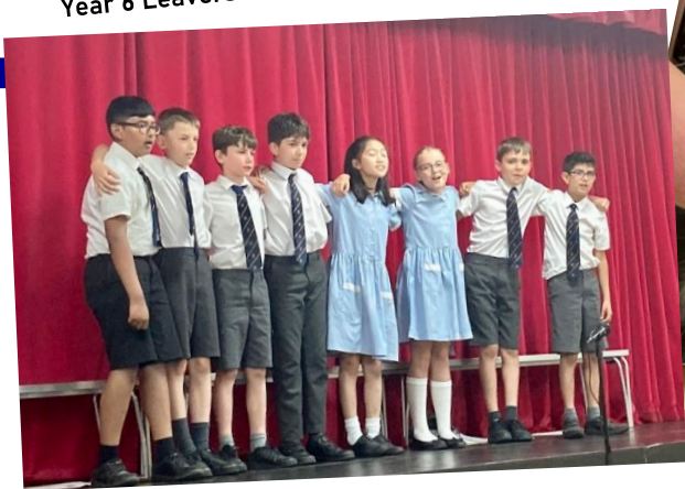
Year 6 Leavers assembly