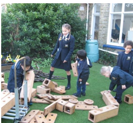
The wet weather meant no Woodland Adventures this week so EYFS and Year 6 spent the afternoon together