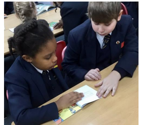
Enjoying our paired reading