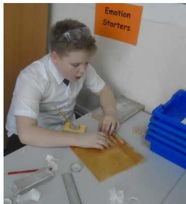
Oak class making percussion instruments in their DT lesson