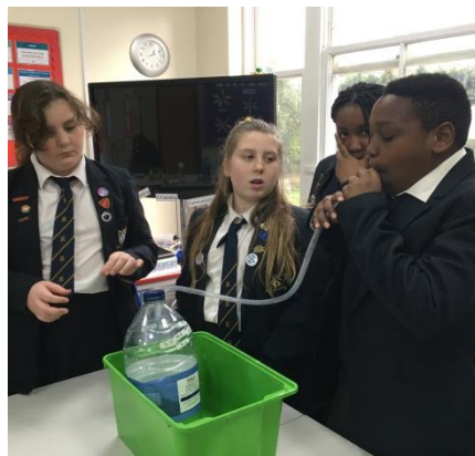
Oak class testing their lung capacity