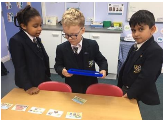
Woodpeckers created a presentation about the Three Little Pigs