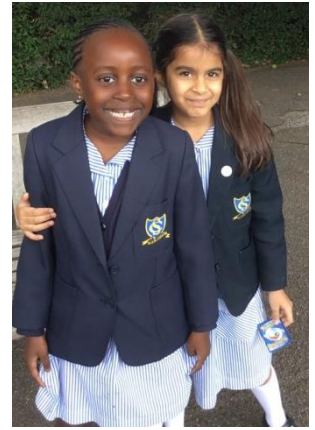
Welcome back old friends!