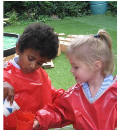
Our EYFS children have had a very busy week!