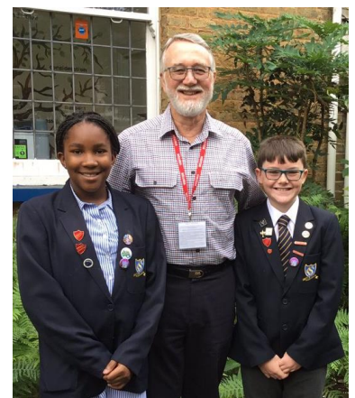
An old boy returns!