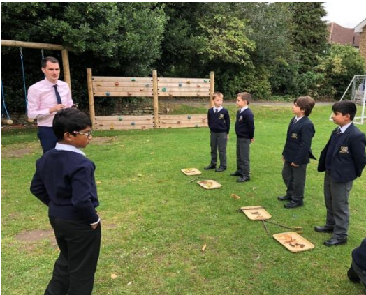
Maple's outdoor maths class