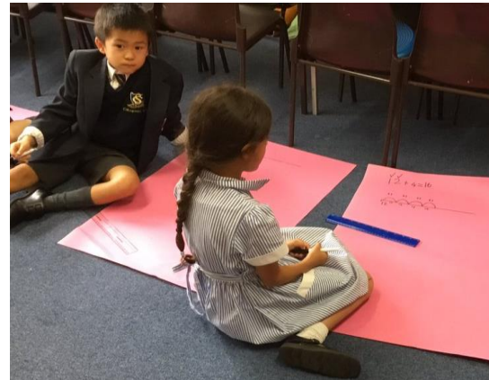
Owl class solving their maths problems