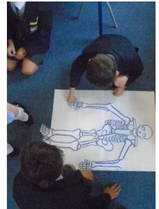
Ash learning about the human skeleton