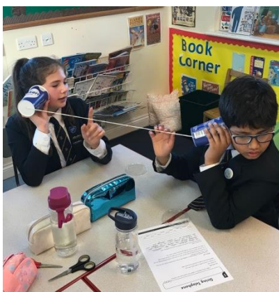
4A & 6A joined forces to discover if sound could be transmitted down a string on a yogurt pot telephone. They used great collaboration, creativity and critical thinking skills!