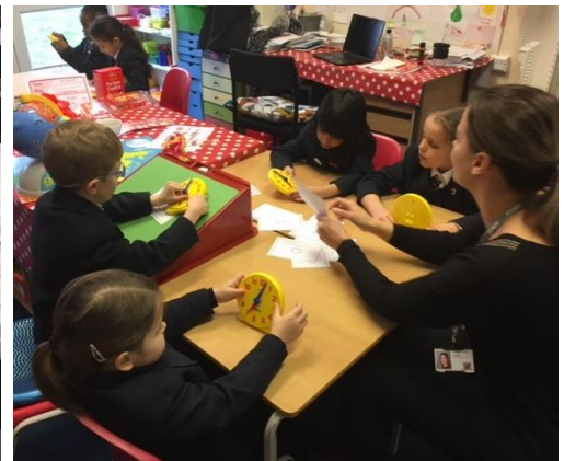
1A developing their collaboration and communication skills solving challenging time word problems together