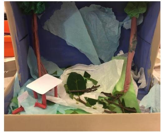
3A have created Surrealism shoe box scenes