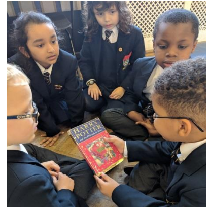
1A & 2A speaking and questioning