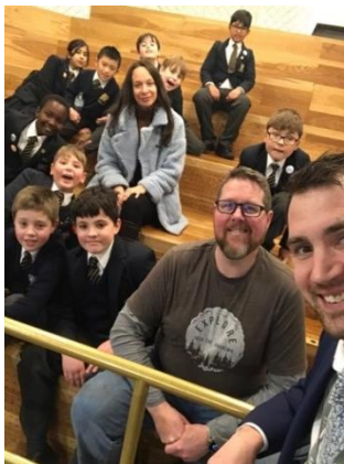
4A had great fun at the Science Museum