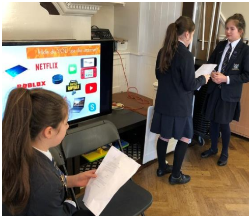
Learning all about Safer Internet Day