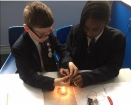
5A used different metal objects to complete an electrical circuit