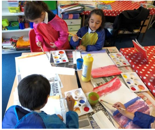
1A creating horizon paintings