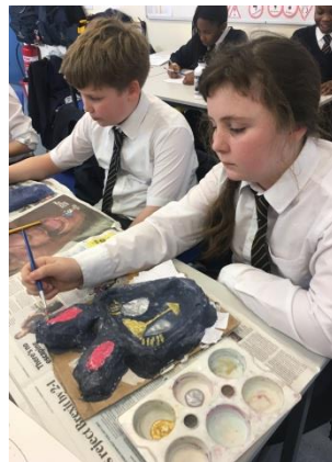
5A painting their Egyptian masks