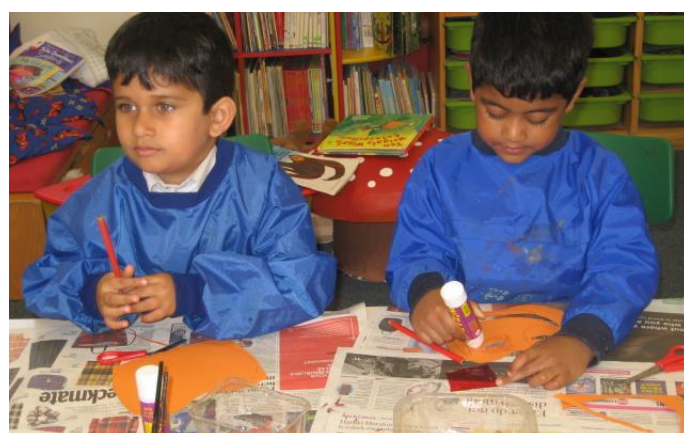
Reception pumpkin decorating