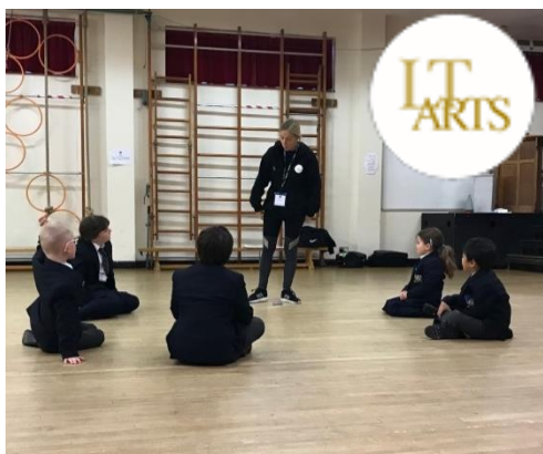
Come along and join our exciting new breakfast club – Love Theatre Arts!