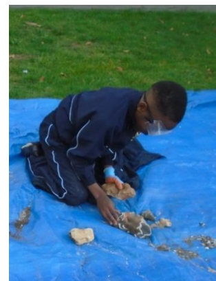
Y3 tried the ancient art of "flint knapping" – digging for flint using a deer antler then uncovering the flint using stones