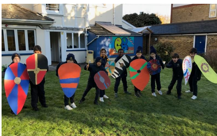
Y4 ready for Battle!