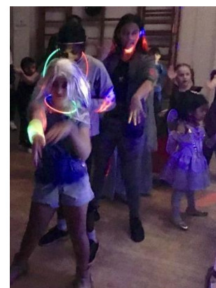
Our Autumn Disco was a fantastic evening with great fun had by all!